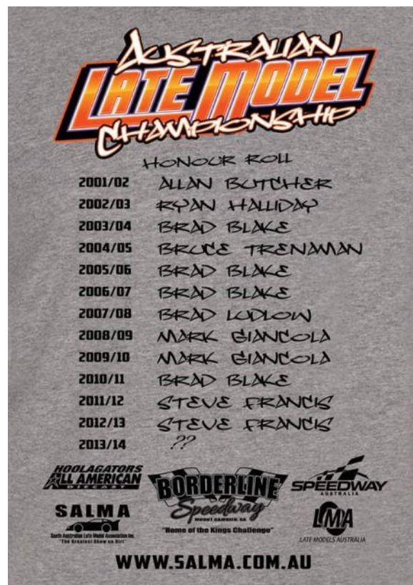
ABOVE 3 IMAGES : 2014 Australian Late Model Title T Shirt design.