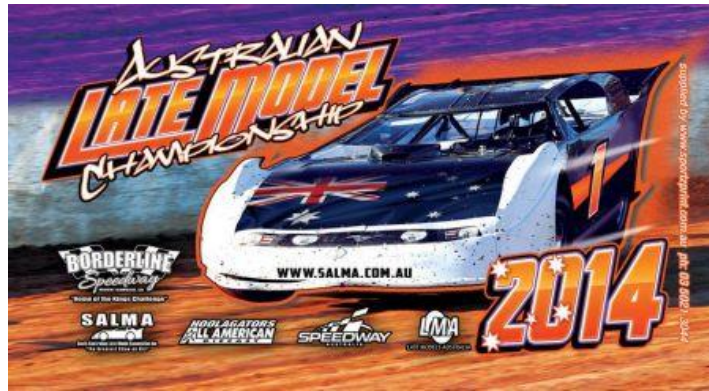
ABOVE : 2014 Australian Late Model Championship Stubby Holder.